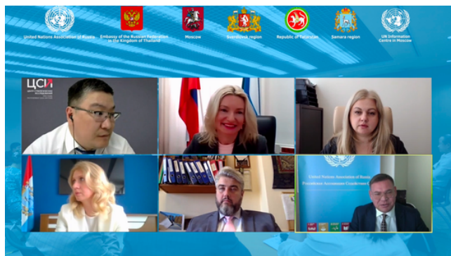
"Russian cities, regions and businesses accelerate climate action for sustainable development", seventy-ninth session of the Economic and Social Commission for Asia and the Pacific, UN ESCAP, May 17, 2023 https://una.ru/news/359