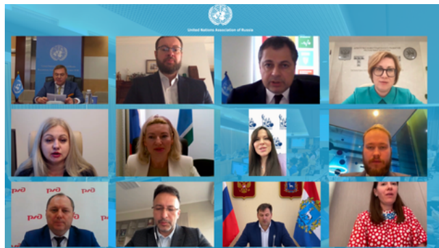
Halfway towards 2030: cooperation between regions, cities and businesses to accelerate transformations for achieving the SDGs while recovering from the coronavirus disease (Covid19)", HLPF, July 19, 2023 https://una.ru/news/371