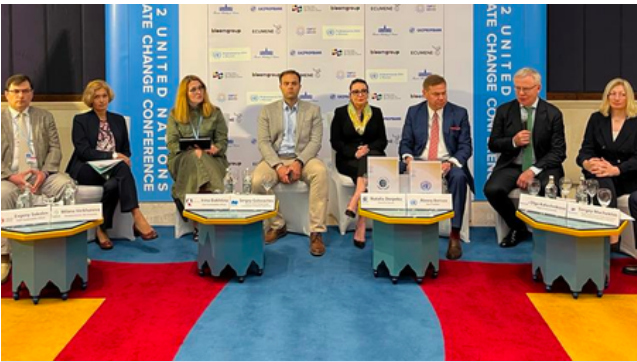
"Green Business. The Role of the Private Sector in Restoring Dialogue to Advance the Climate Agenda", COP-27, Sharm el-Sheikh, November 14, 2022 https://una.ru/news/318/