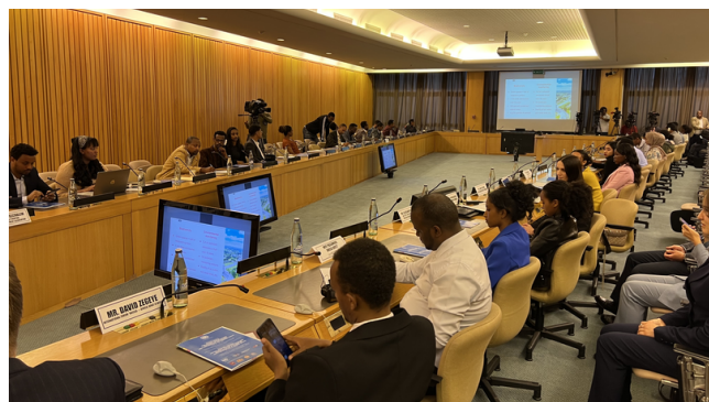
Forum "Russia-Africa. Sustainable urban future: exchange of experience and Partnerships for common goals" UN ECA, Addis Ababa, June 27-28, 2023 https://una.ru/news/367