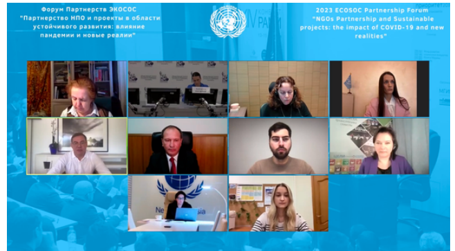
"NGOs Partnerships and sustainable projects: the impact of COVID-19 and the new realities", ECOSOC Partnership Forum, January 31, 2023 https://una.ru/news/340