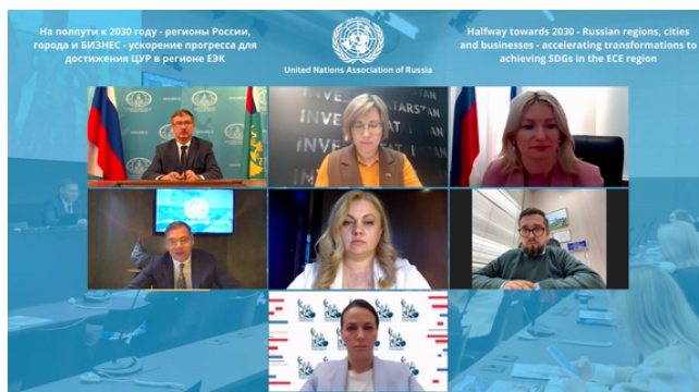
"Halfway towards 2030 — Russian regions, cities and businesses — accelerating transformations to achieving SDGs in the ECE region" RFSD 2023, Geneva, March 30, 2023 https://una.ru/news/349