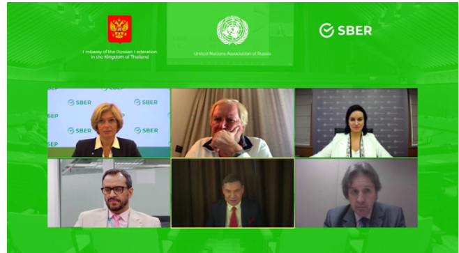
"Cooperation of the banking sector and business of the Russian Federation and the Asia-Pacific region...", Third Ministerial Conference, UN ESCAP, September 29, 2022 https://una.ru/news/314