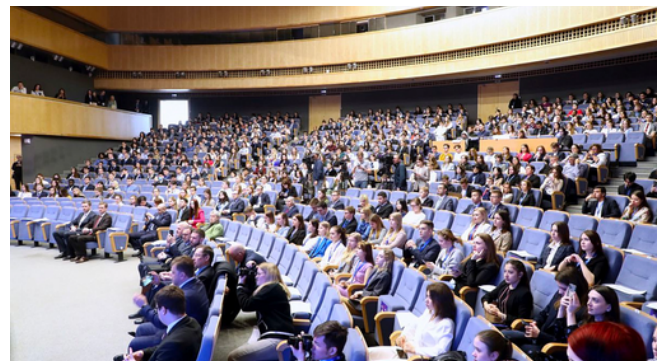
Churkin Moscow International Model United Nations, MGIMO University Moscow April 18-22, 2023 https://una.ru/news/305