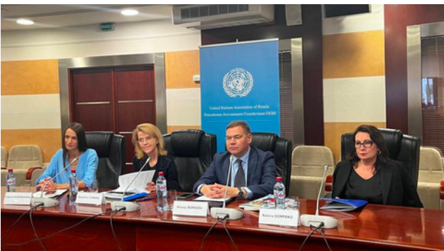
"Russian Regions and Business: Building back better from the coronavirus disease (COVID-19) while advancing the full implementation of the Agenda 2030", HLPF, July 13, 2022 https://una.ru/news/312