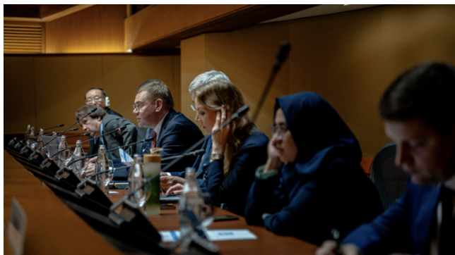
"Partnerships to Promote Sustainable Energy: Regions of Russia and businesses (SDG7 is under review)", APEF2023, UN ESCAP, Bangkok, October 18, 2023 https://una.ru/news/378