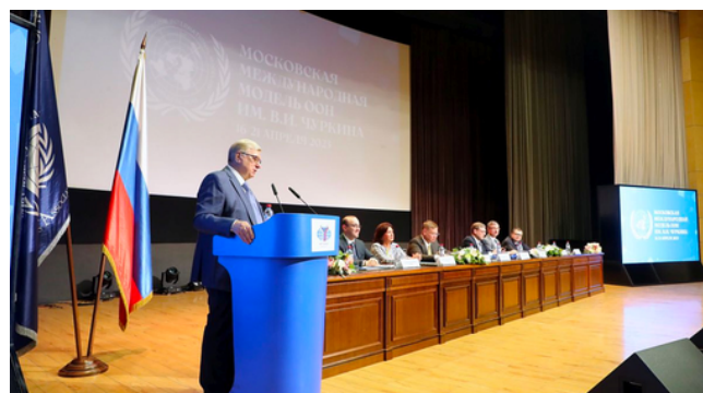
Churkin Moscow International Model United Nations, MGIMO University Moscow April 17-21, 2023 https://una.ru/news/353