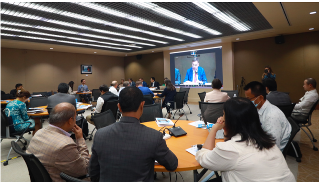
"Implementation of the 2030 Agenda for Sustainable Development: Cooperation between Cities, Regions, Business and Governments – Practices Exchange", APFSD, UN ESCAP, Bangkok, March 29, 2023 https://una.ru/news/347